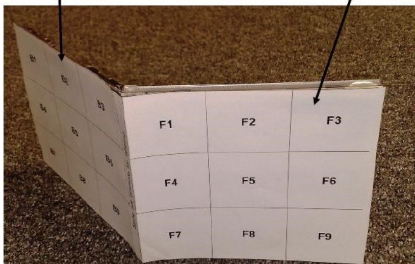
Front side of Jewel Box