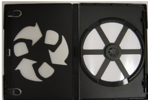
Photo of Eco-Box

All Booklets & Inserts must be made to the dimensions shown on page 2 to be fully held in place by case both clips and function properly in automation with the Eco-Box unique cutouts. If smaller inserts are requested then manual packaging charges will apply.